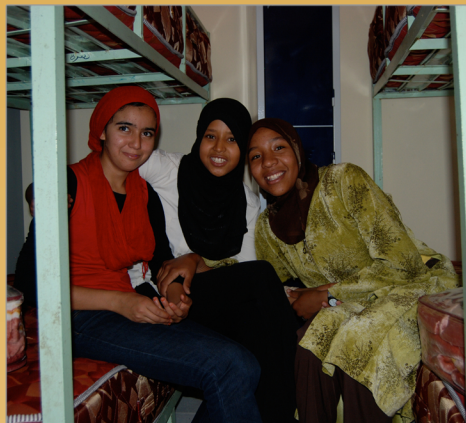
THE MATTRESSES, LOCKERS, BLANKETS AND PILLOWS WERE A HIT WITH THE GIRLS