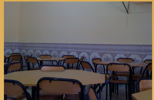
DECORATIVE TILE WAS ADDED AND NEW TABLES AND CHAIRS WERE PURCHASED