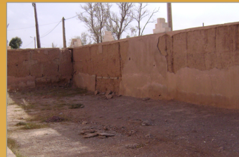
WE REPAIRED AND PAINTED THE WALLS AND BUILDINGS