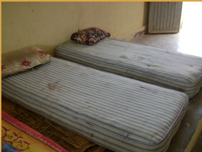
NEW MATTRESSES WERE PURCHASED