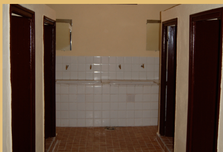
WE REPAIRED AND PAINTED THE BATHROOMS