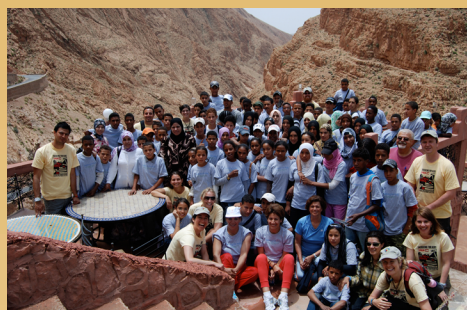
THE KIDS LOVED THE FIELD TRIP TO THE DADES GORGE