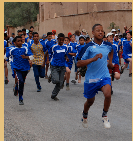
THE WHOLE TOWN CAME OUT TO WATCH THE BIG RACE